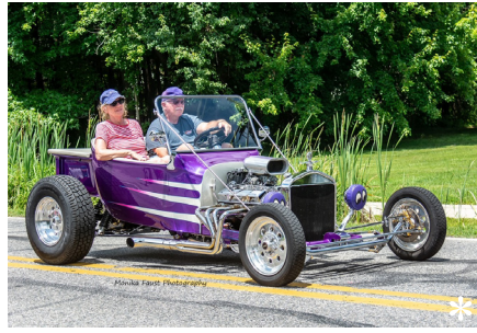
*July 4th Photos