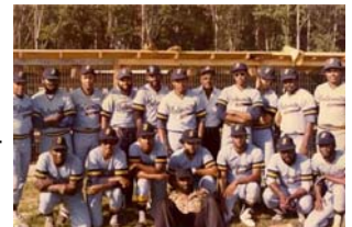
Hot Sox Baseball Team

Come and EXPERIENCE first-hand the restoration process of an 19th century farmhouse; take a walk back in time with an archaeologist and DISCOVER what artifacts can